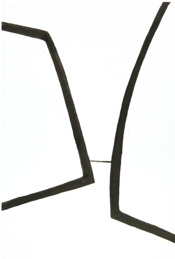
Anna-Eva Bergman (1909 - 1987) Non Titré, 1979 48,9 x 31,6 cm Ink on paper