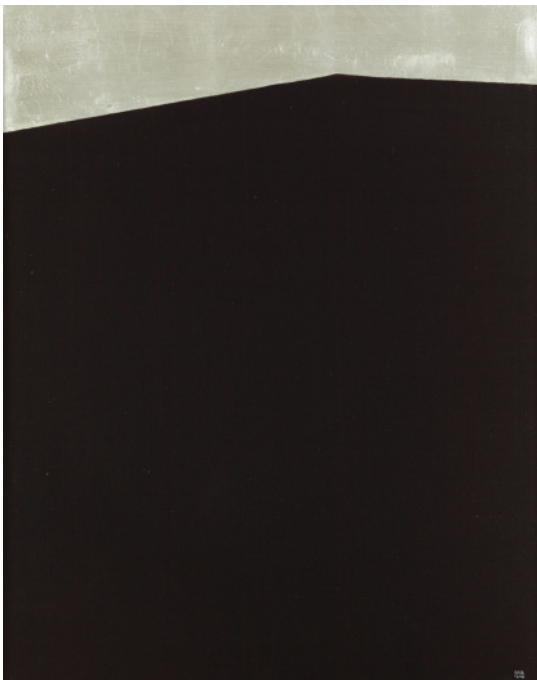
Anna-Eva Bergman (1909 - 1987) N°63 - 1970 Montagne Noire, 1970 70 x 50 cm Ink on cardboard pasted on canvas