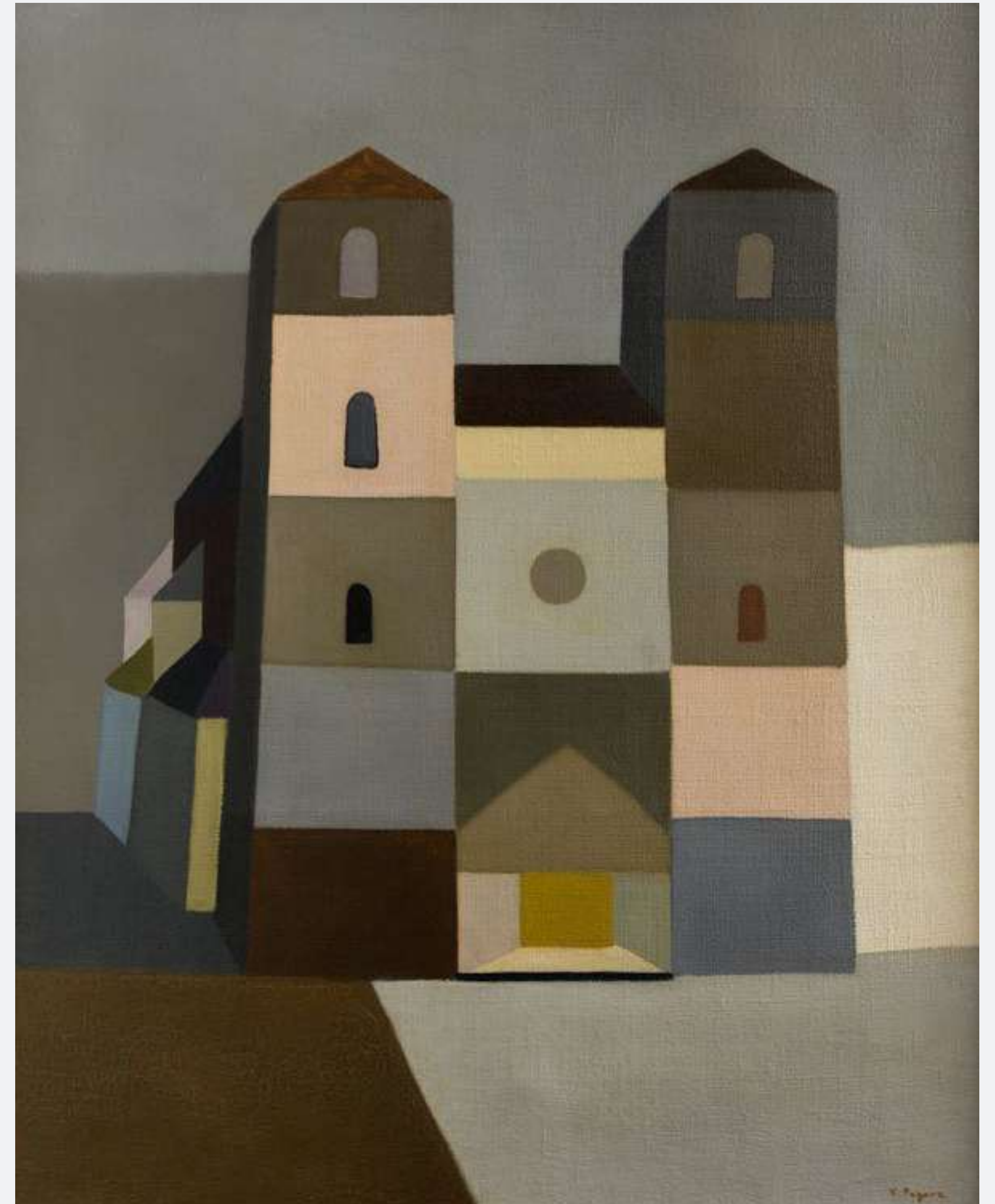
Vera Pagava Eglise fortifiée, 1956 Oil on canvas 92 x 73 cm