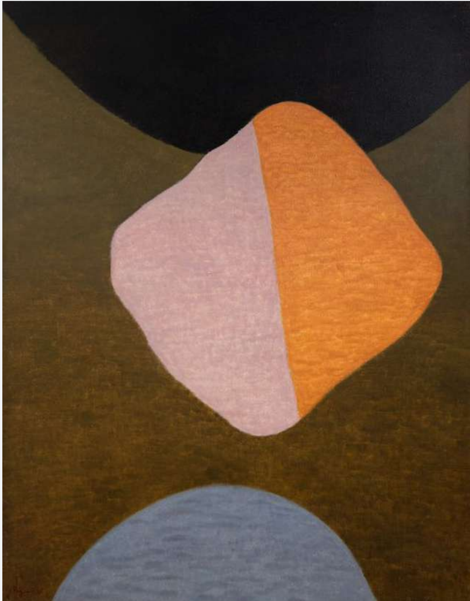
Vera Pagava Concordance , 1965

Oil on canvas 146 x 116 cm