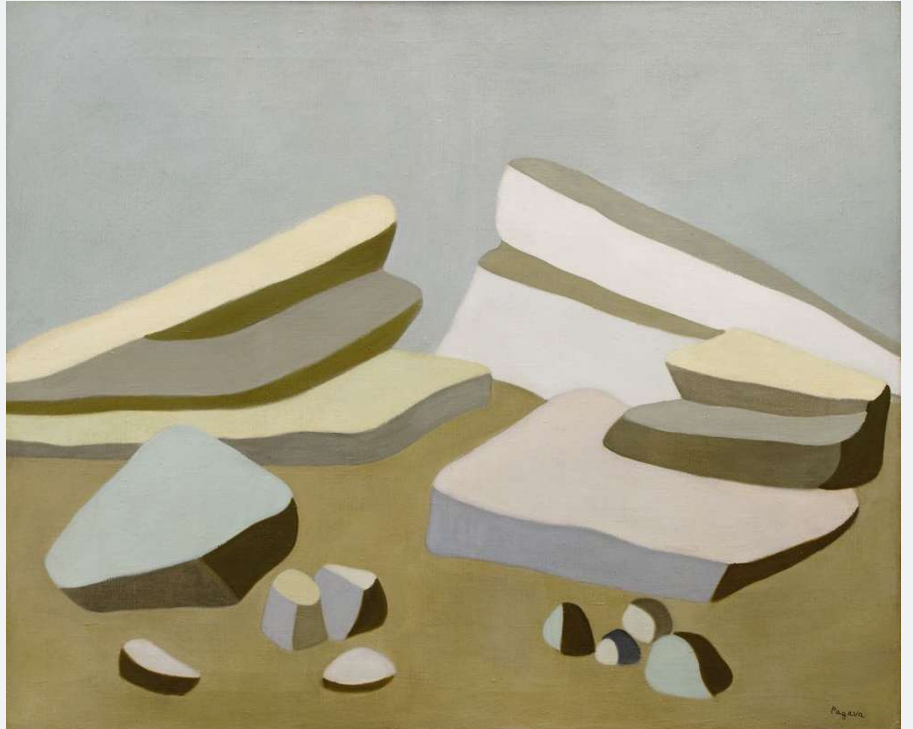
Vera Pagava Carrière , 1950 Oil on canvas 73 x 60 cm