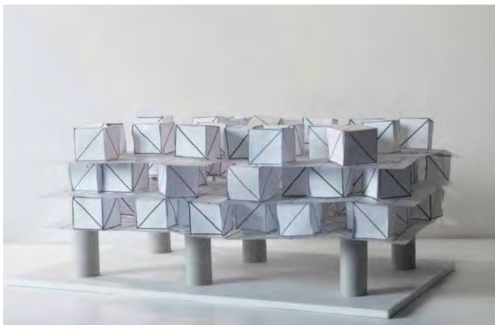
Yona Friedman, Ville Spatiale , 1980, MAMVP collections, Paris

A series of historical and more recent models linked to Friedman's experimental practice of architecture will also be presented. These study models reflect the ideas developed by Friedman and his major concepts : the "Spatial City", the "Containers", the "Cylinders", the "Merz Strukturen", the "gribouillis" and the "Moebien structures". Usually made out of poor materials and domestic waste, they offer a materialisation of the theories dear to Friedman during his career, while revealing the utopian perspective of an architectural practice oriented towards the future, the hopes and needs of humanity.