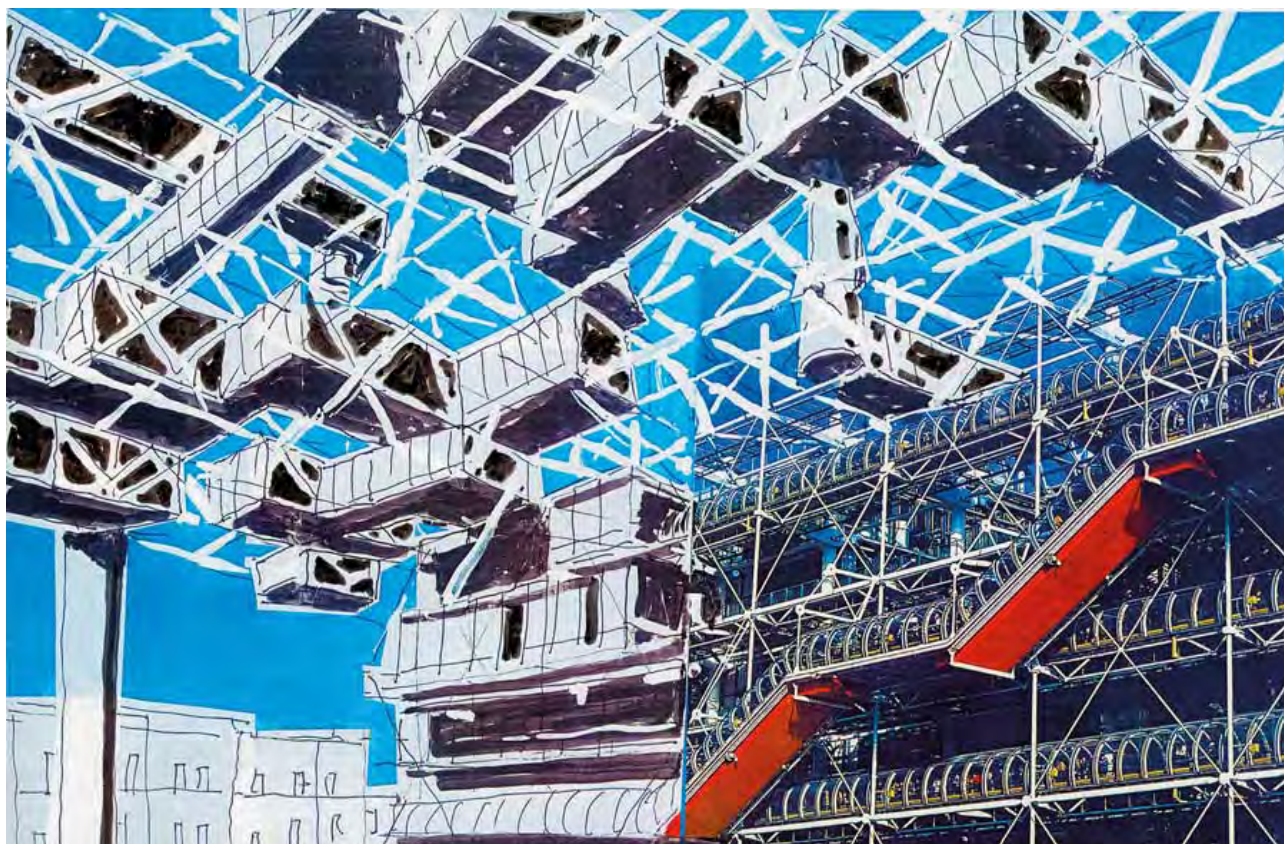
Yona Friedman, Extensions to the Georges Pompidou Center , 2008.