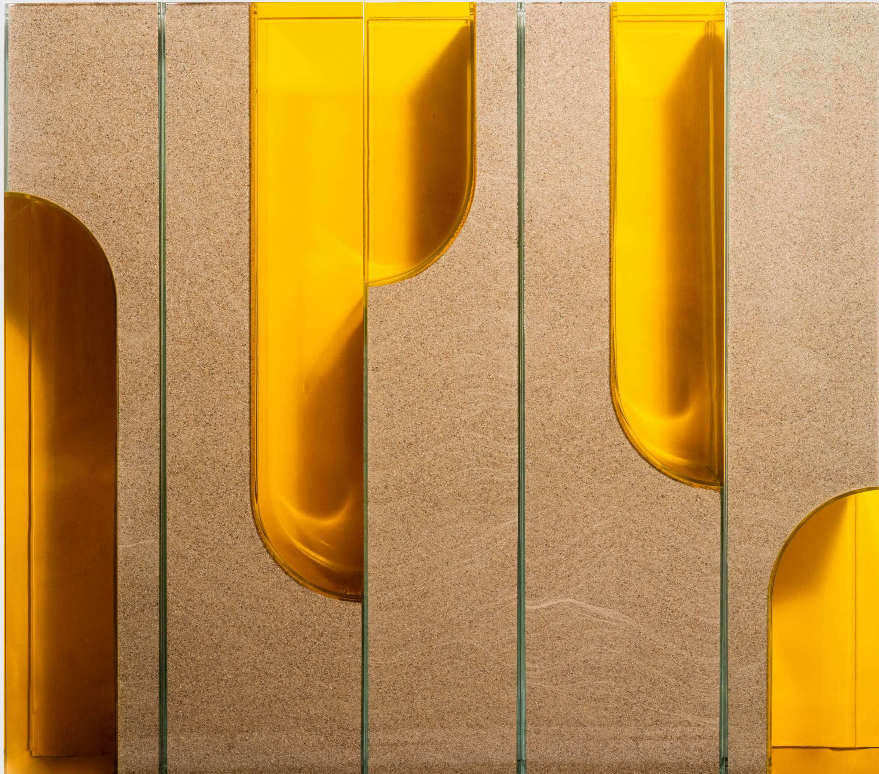
Kapwani Kiwanga Shifting Sands (yellow), 2023

Glass, blown colored glass, silica sand 70 x 80 x 15 cm Edition of 3 plus 2 artist's proofs