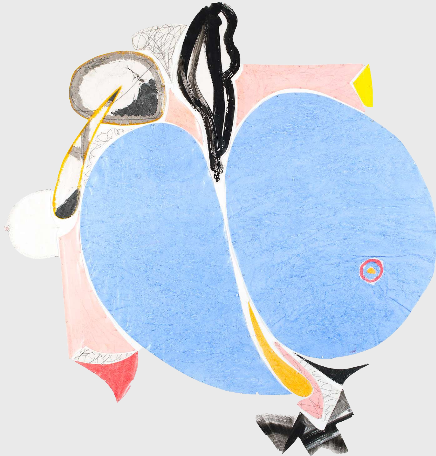
Christian Bonnefoi Composition 18 - Le Rayon de la Providence, 2015

Acrylic and collage on panel 229 x 129 cm