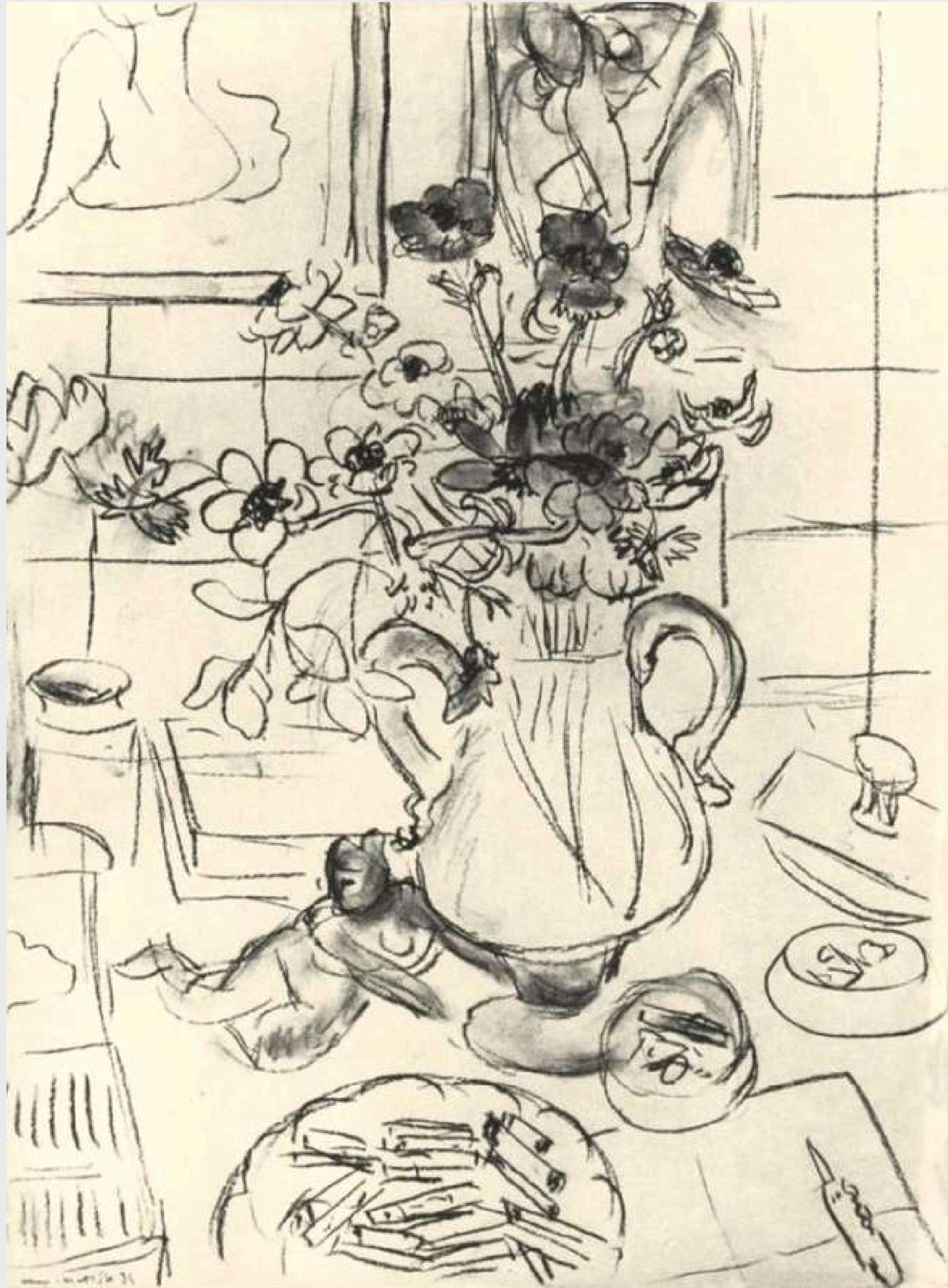
Henri Matisse Dans l'atelier de l'artiste, table avec nature morte et modèle, 1944