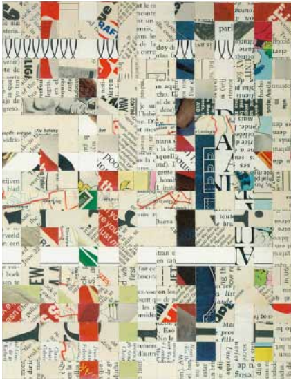
Kees Visser , Tressage N°3 T , 1977 Weaving paper and framed magazines 34 x 24 cm (frame 42 x 32 cm) Unique

«I FIRST CAME TO ICELAND IN 1976. Back then it felt like an international place, and because the art world was so small here, it was very accessible. For example, I never met Donald Judd in Amsterdam, but I met him in Reykjavik. Iceland derived its visual art from its narrative and literary traditions, which I found very charming because I've always had a more formal attitude. I lived here during three different periods until 1993; all together it's been twelve years. So I've been in Iceland more than in Holland, where I was born, or in France, where I lived for five years. I worked in the Icelandic countryside, which was where I lived during the first two periods; later I worked in Reykjavik where I lived with my family for almost eight years. My new retrospective covers the work that I made here during those periods, and it is updated by two other pieces that are more recent. It's an emotional moment to have such a big exhibition here.