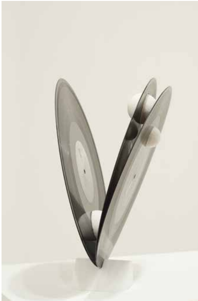
Kapwani Kiwanga Hydrospheres , 2015 Vinyls, salt Courtesy Kapwani Kiwanga

In 2016, Kapwani Kiwanga will also have an important solo show at Armory Show being named as a commissioned artist of the New York art fair.