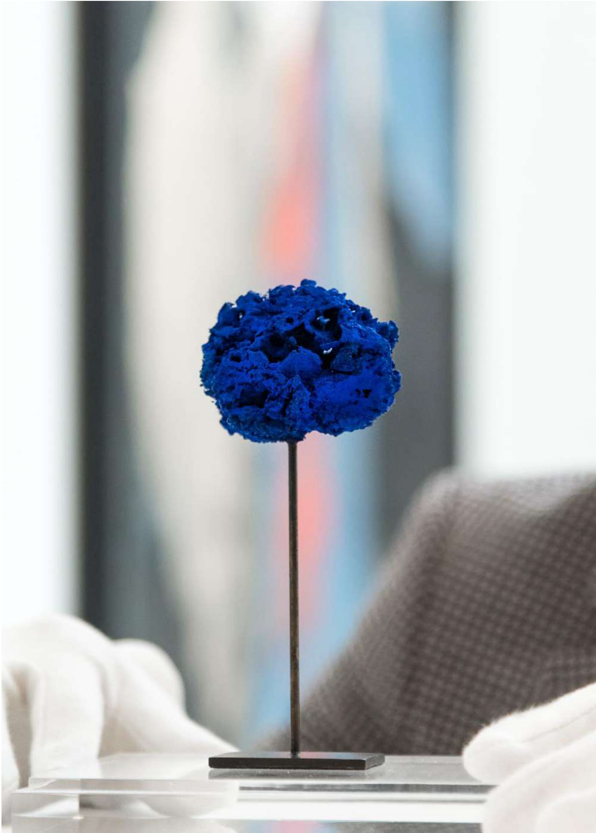
© Yves Klein, Untitled Blue Sponge Sculpture (SE 314) , c. 1961, Courtesy of Clavé Fine Arts, Paris