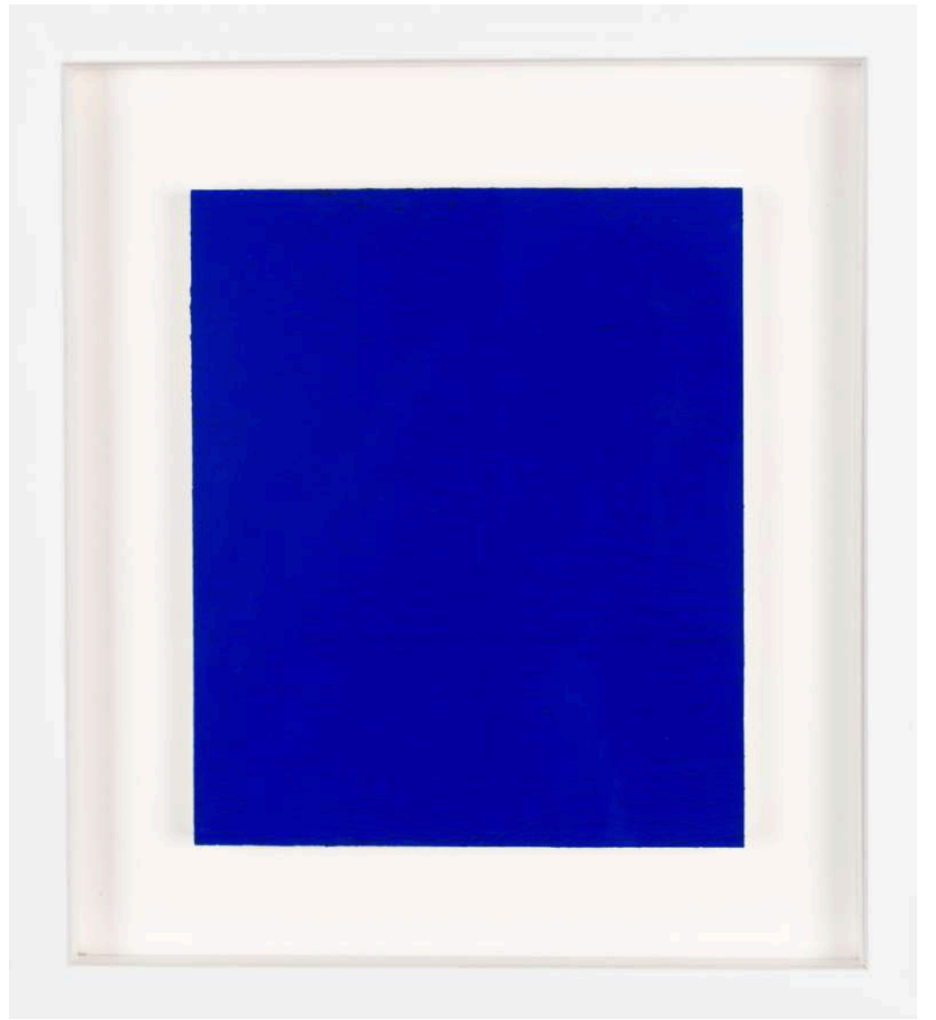
© Yves Klein, Untitled Blue Monochrome (IKB 308) , 1959