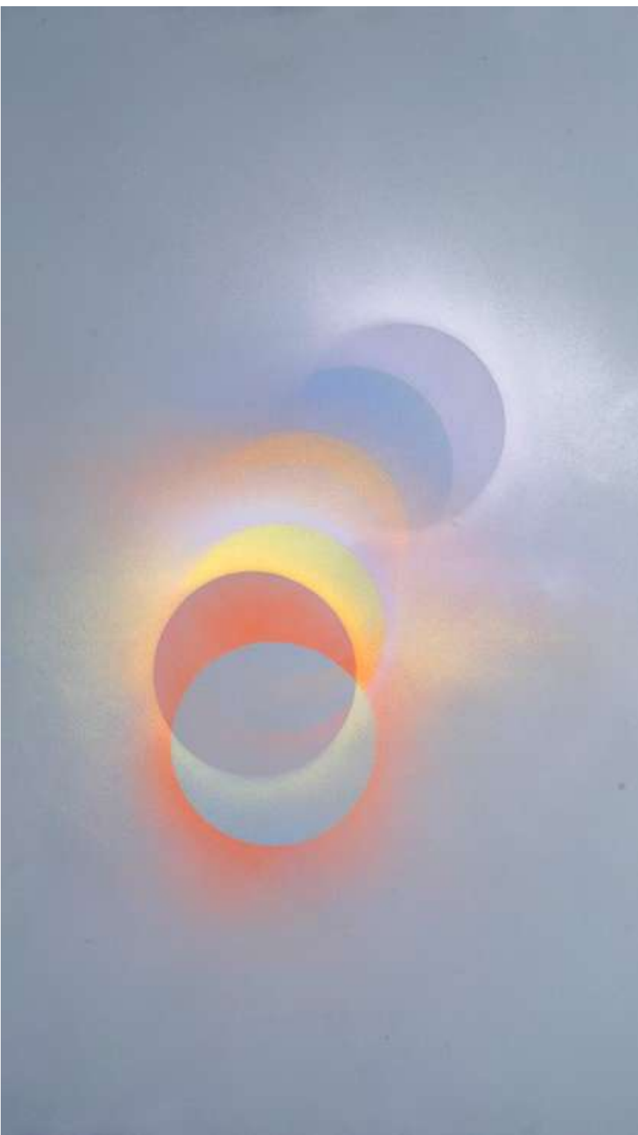
© Rotraut, Sans Titre , 1972